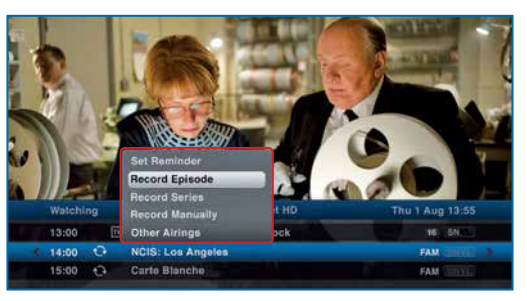
Step 2 After scheduling a recording, the programme is marked as a scheduled recording and listed in "Schedules" in "Planner".

Step 1 Press OK on any programme to see the recording options available. If the programme is part of a series, you can record just the episode, or the entire season of the series.